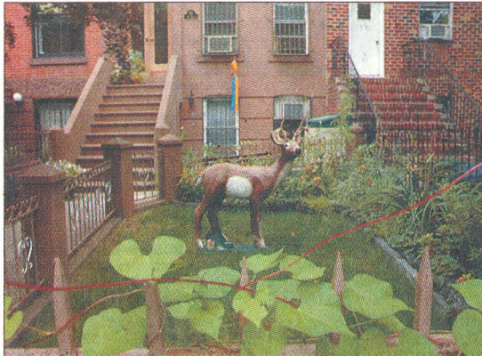
Exposed to the elements: Digital photographer Tim Connor documents the wildlife in Carroll Gardens in Safe-T-Gallery's new show "Brooklyn au Natural."